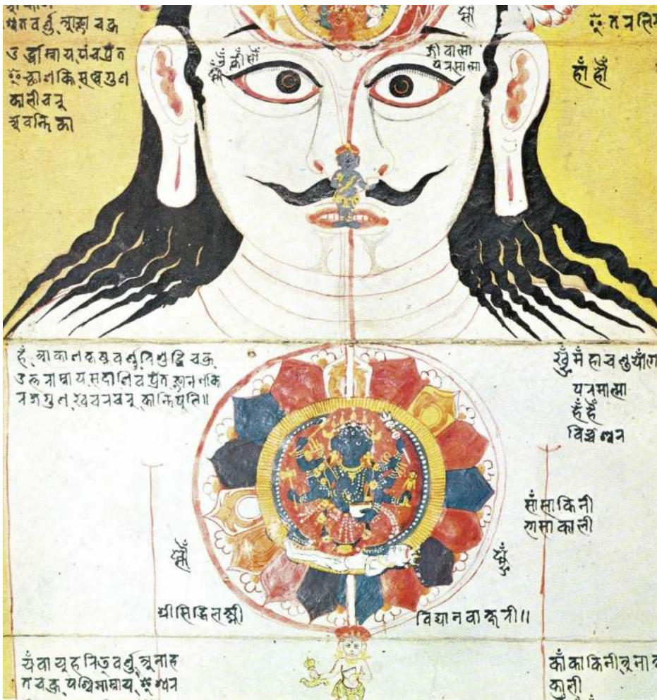
A 17th-century image of several chakras from Nepāl.

Tagged: cakra ( /blog/tag/cakra ), chakra ( /blog/tag/chakra ), mantra ( /blog/tag/mantra )